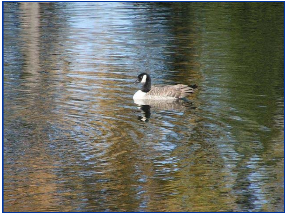
Duck at Henderson Lake