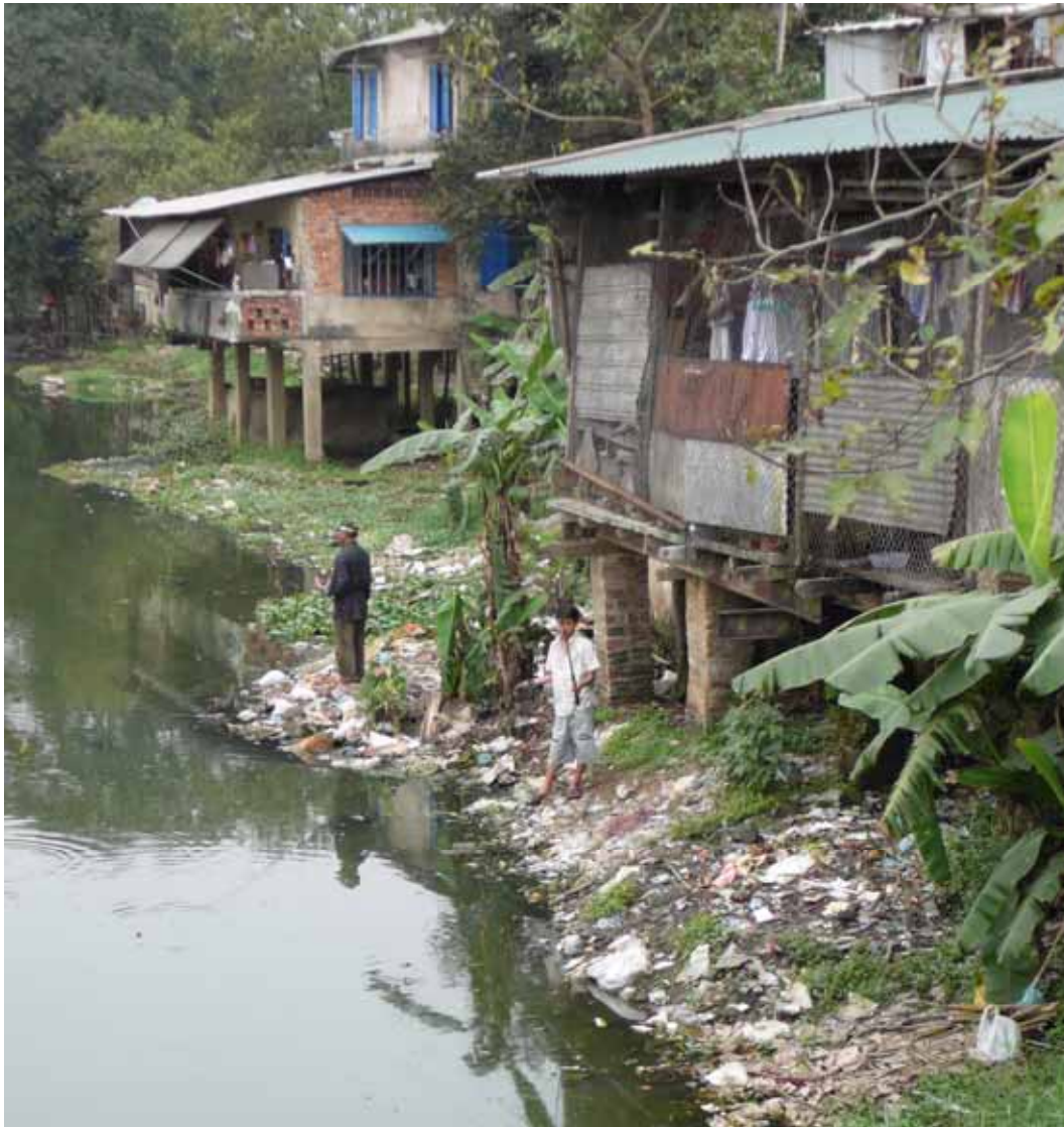
Shelly Stetsko, BC Branch

The National Newsletter is having a photo contest. Send us your good, bad or ugly environmental public health photos. Categories are food, water, air and environment (e.g. pools, housing, personal services, waste management and communicable disease). At the end of the year, if your picture is chosen by the Newsletter staff, you may win the dubious honor of having the Photo of the Year . Please include your name, the Branch you belong to, photo credits, category, caption (optional) and any brief commentary you wish to provide. E-mail your photos to: newsletter@ciphi.ca . Good luck!